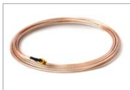
5m high temp lead with SMA connector

Cables are available with TNC, BNC and SMA Terminations and in lengths of 1.2, 5, 10 and 20m. Coiled and straight cables are available for portable instruments.