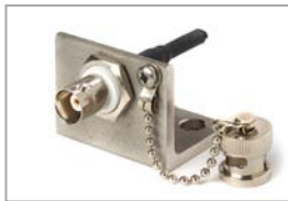
Single channel open bracket BNC connector

We have two methods of terminating the cables in permanently installed sensors. Junction boxes are available from 1 through 6 way or as a right angled bracket with a connector. Both methods come complete with dust caps and BNC connectors. Note that "Bracket" has a fixed cable length and cannot be shortened. Other length options can be made to order.