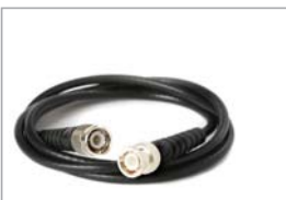
Coiled cable for MHC memo